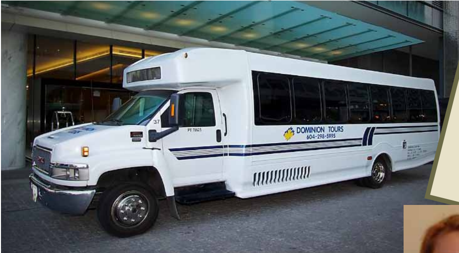
The bus will say Dominion Tours on the side